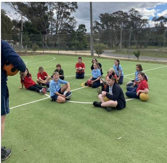
Music Recorder Singing