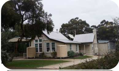
NATTE YALLOCK PS 1347